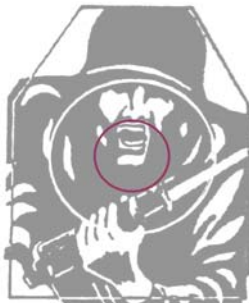
Match 3 / 4 / 7 / 8 Fig 12/59 handheld 12" Bull - 6" V-Bull