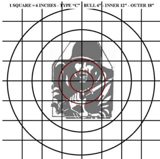
Match 1 Fig 12/C on a 4 X4